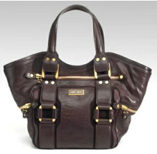
the bag, purse