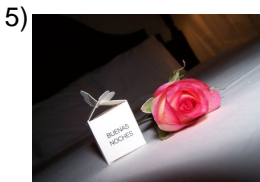
good evening, good night