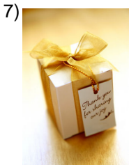
thank you very much