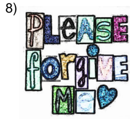
forgive me, excuse me