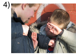
to bother, to bug