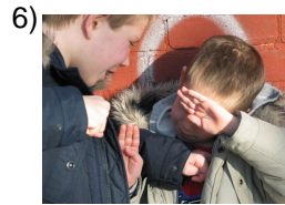
to bother, to bug