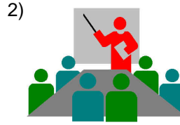
meeting, get together