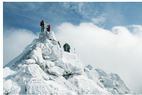
on top of