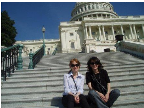
in front of