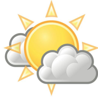
to be cloudy