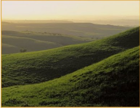
large hill, foot hills