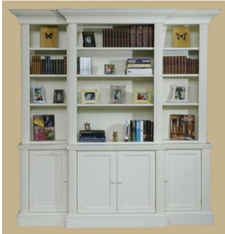
bookcase or shelves