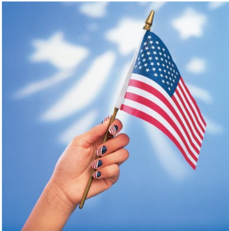
Fourth of July