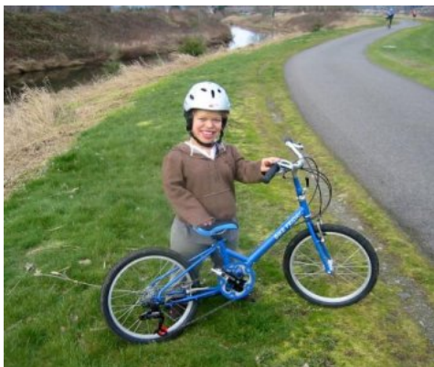
a short person