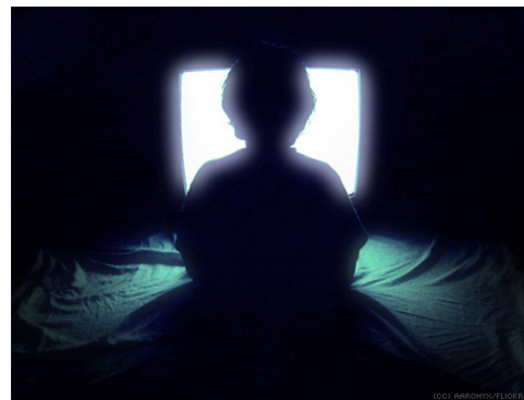
watch, to look