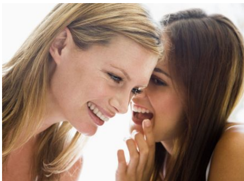
to talk/to speak