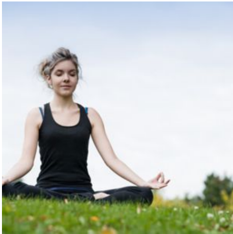
I feel very good